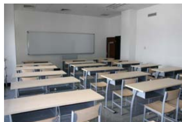
Classroom Language Course